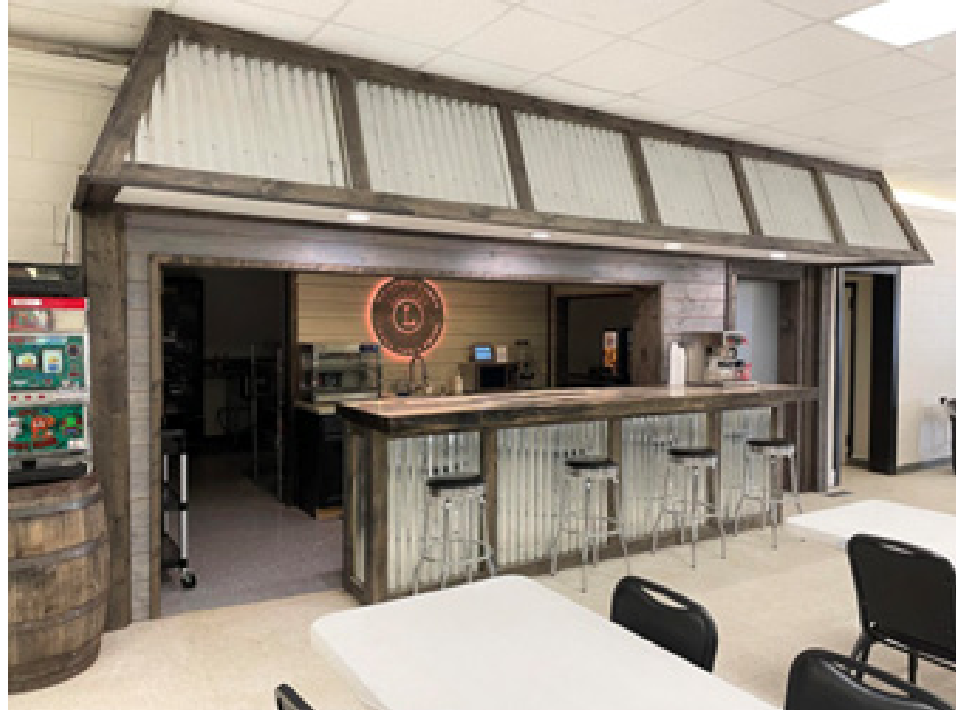
Memphis Lions Club Indoor Kitchen