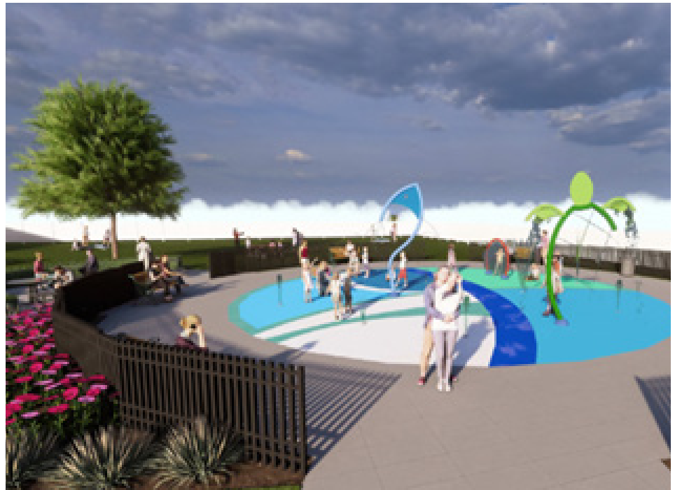
Marine City Guy Center - Splash pad

The Ralph C. Wilson Jr. Foundation has a growing focus on rural communities in both Western New York and Southeast Michigan, including St. Clair County. Their focus on small town "hubs" is rooted