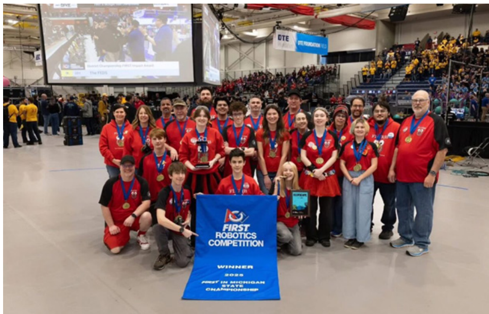
Blue Water Area Robotics Alliance

grants made so far reflect that.” Some highlights include: