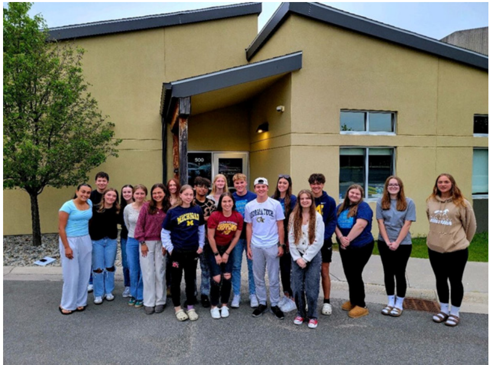
Youth Advisory Council (YAC)