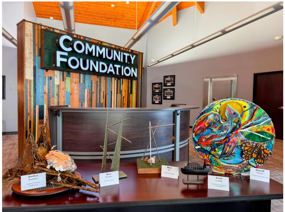
Five finalists' 3D models for the Blue Water River Walk sculpture project are displayed in the lobby of the Community Foundation of St. Clair County in downtown Port Huron. They will remain on display until Oct. 3, 2025.

Public art has been central to that vision, with sculptures like "Stella the Sturgeon" and "Sugar the Horse" connecting people to the region's history and environment.